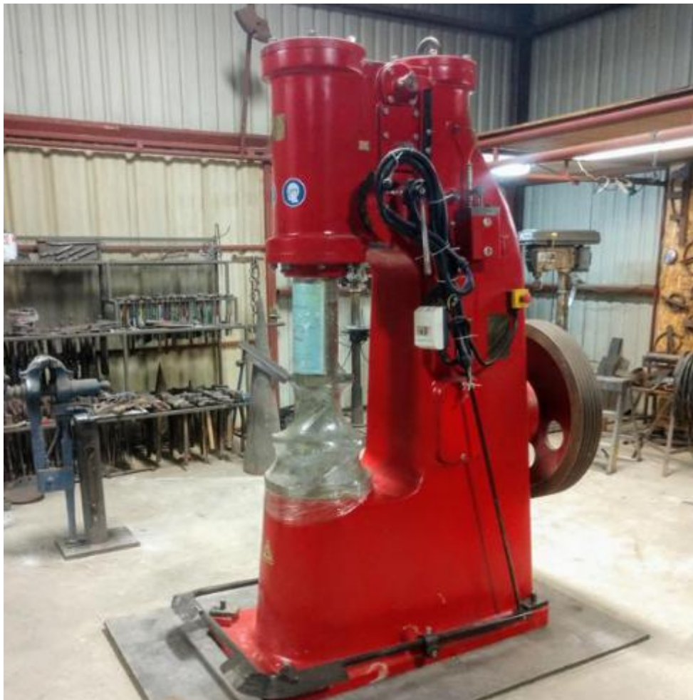
75KG hammer in USA Customer Shop