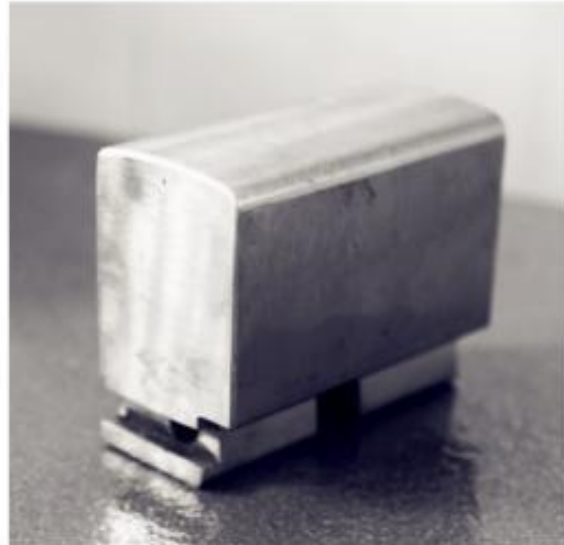
2# Fullering Die