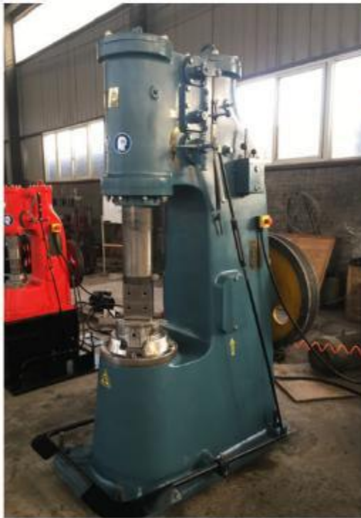
3# RAL 7031 Blue grey