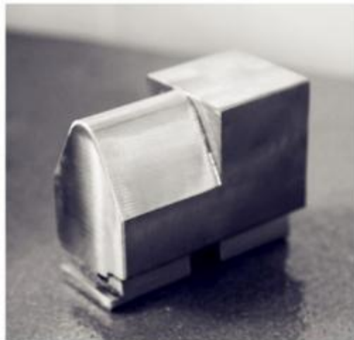
3# Drawing/flat Die