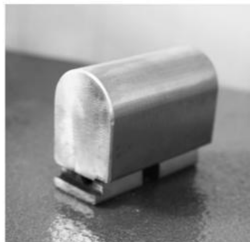
6# Heavy fullering Die