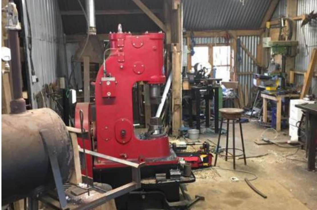
25kg Hammer in France Customer Shop