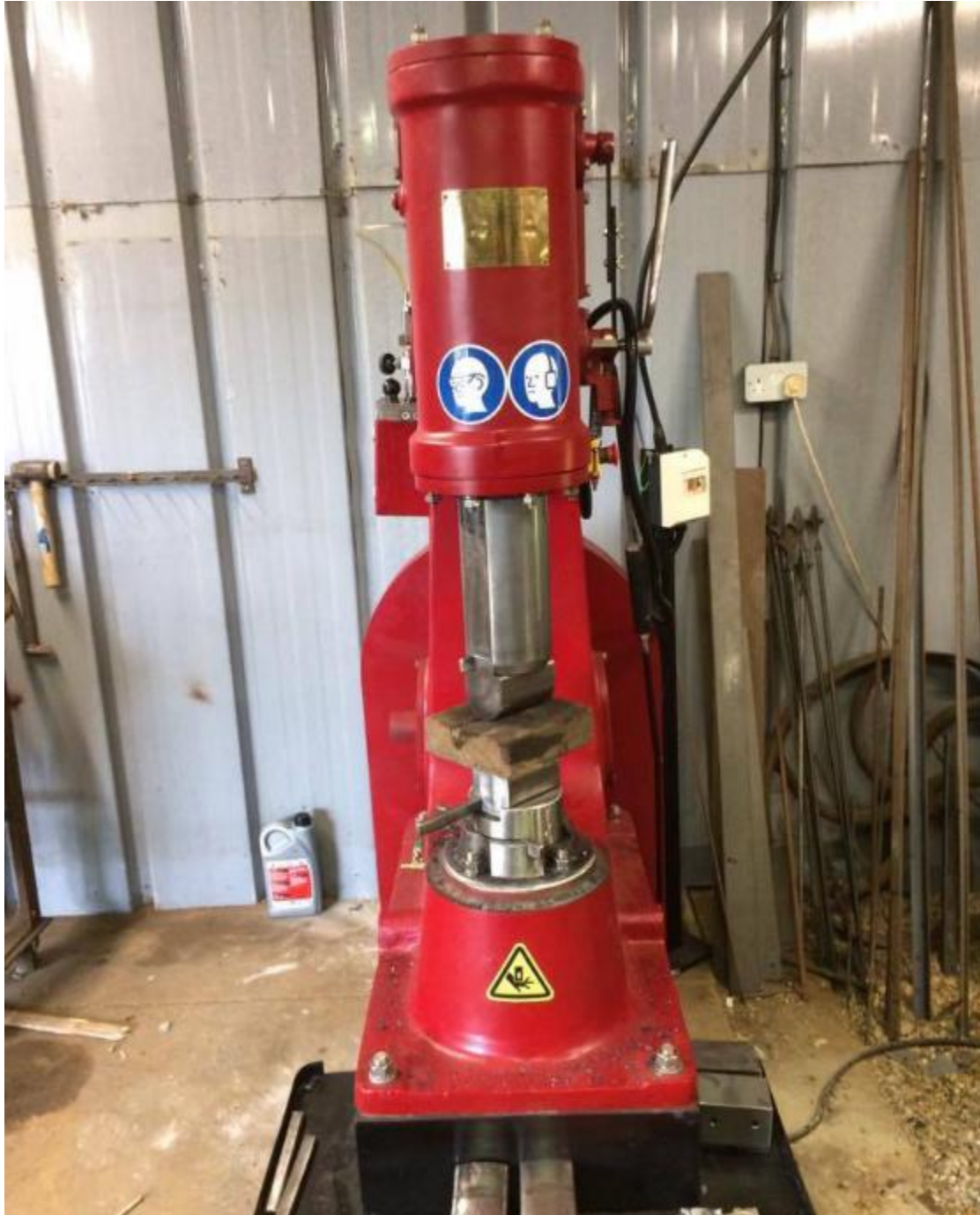
25kg Hammer in Australia Customer Shop