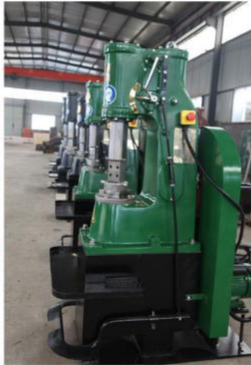
4# RAL 6002 Leaf green