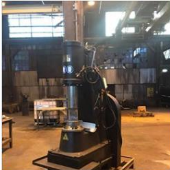
40kg Hammer in USA customer shop