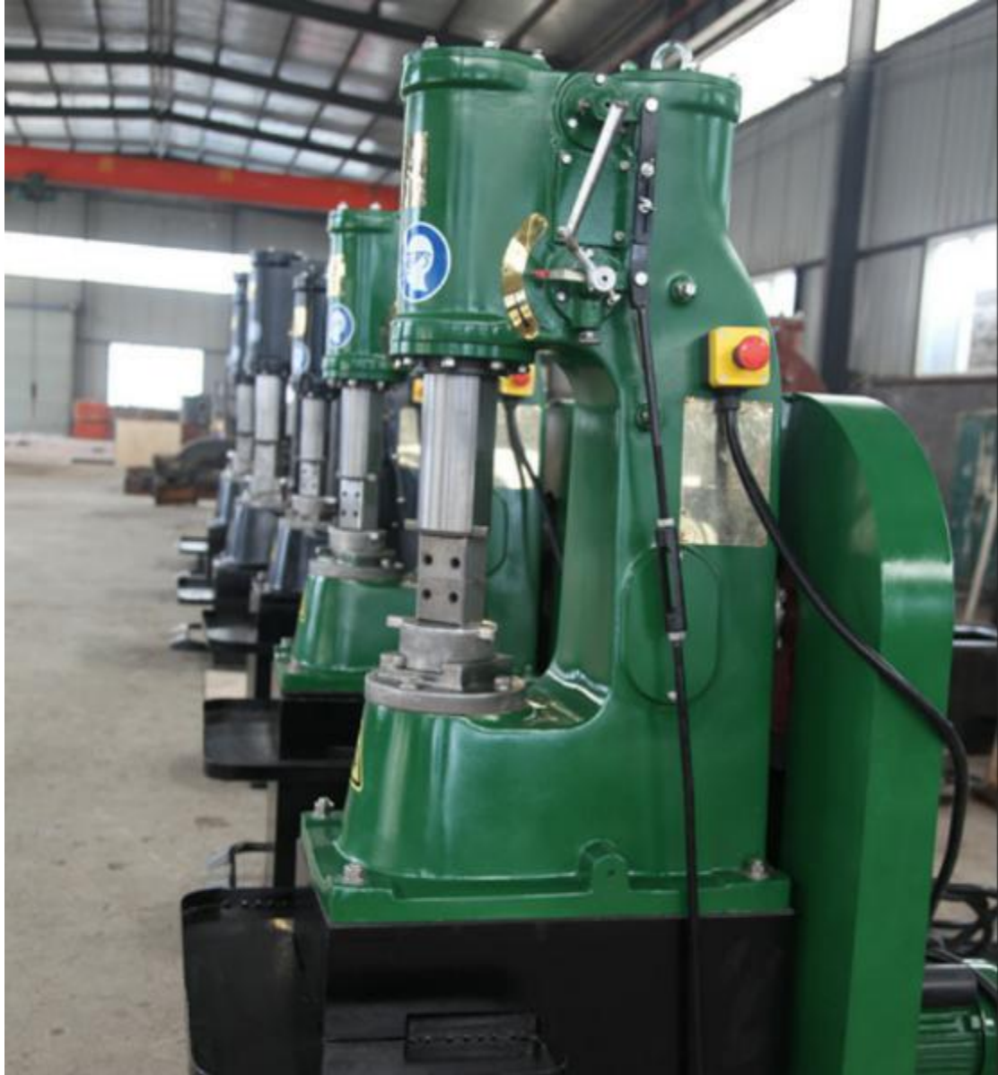
15kg hammers for UK customer.