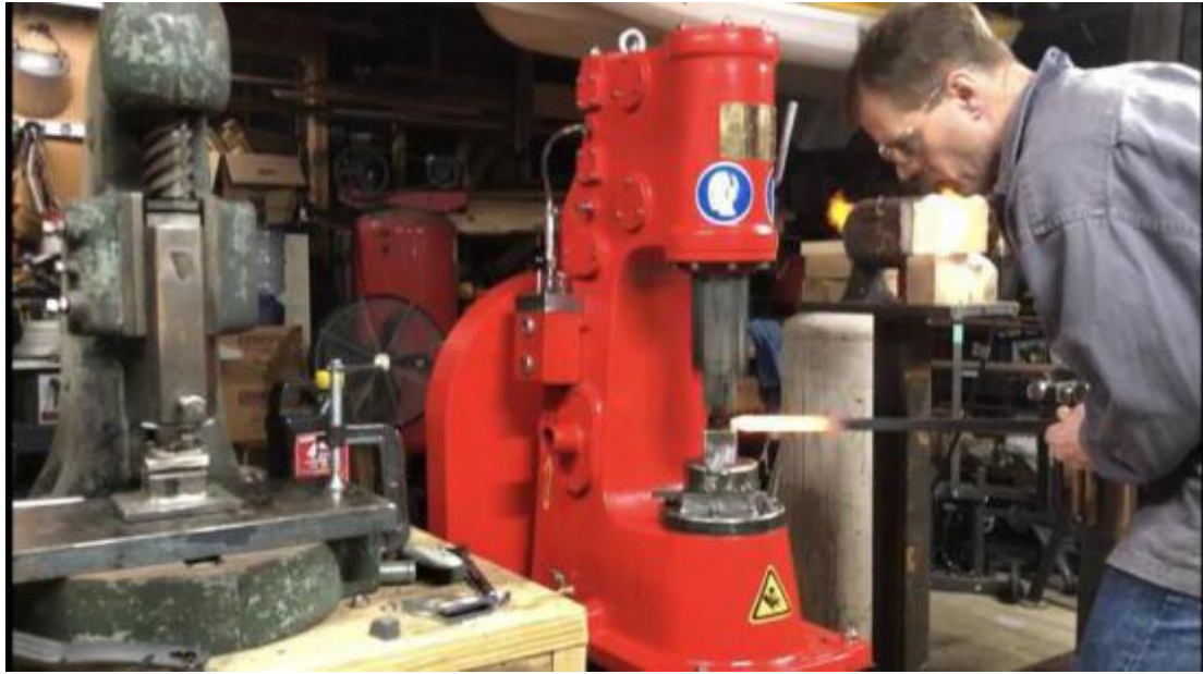
15kg hammer in USA Customer Shop