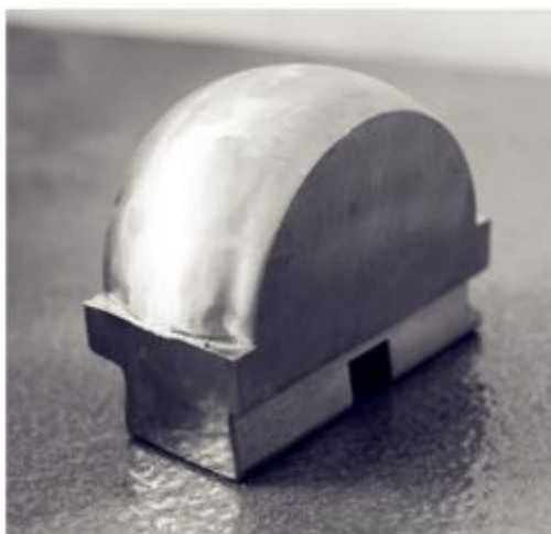
5# Crown Die