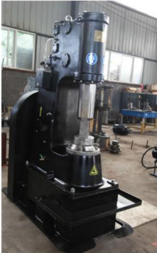
1# Matt black