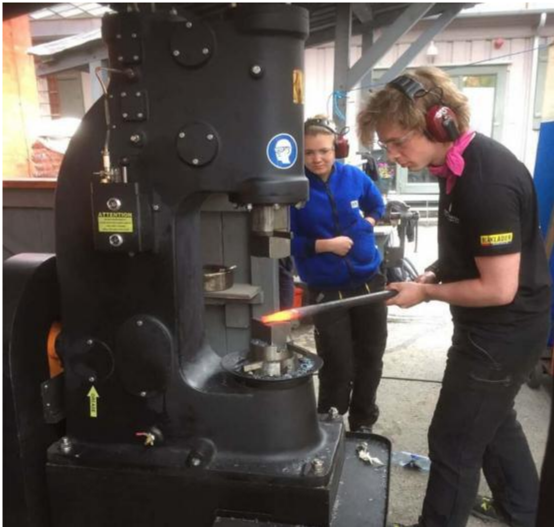
25kg hammer in Norway Customer Shop