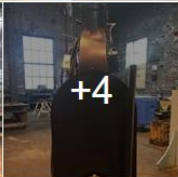
40KG Hammer in USA Customer Shop