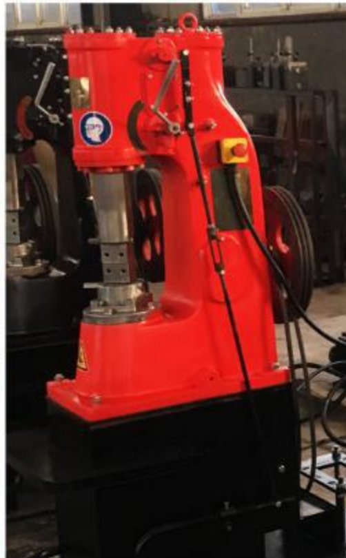
2# RAL 3020 Traffic Red